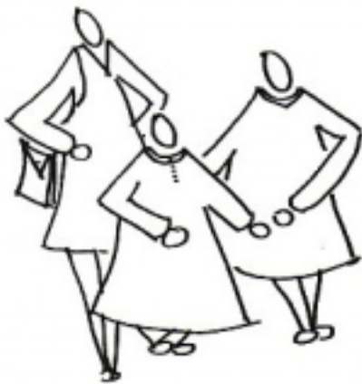
A Purse of Our Own

Today, Rochester women continue this tradition of leadership and service in all areas of our community — the arts, business, civic improvement, education, and government. They are shaping the community just as their mothers and grandmothers did before, often selecting the same organizations for support and creating their own legacy of service.