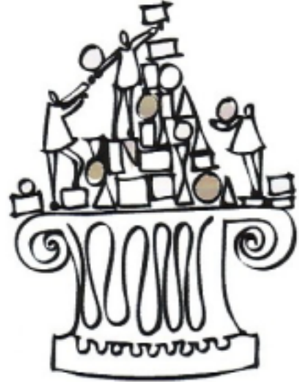
Building a Legacy